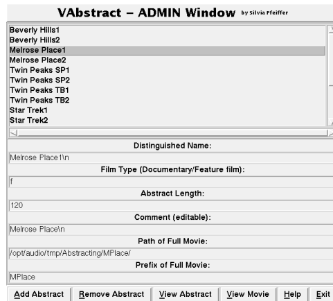
Figure 3: Provider Interface for VAbstract

Two example application interfaces were built in about another 2500 lines of Tcl/Tk code on top of VAbstract : a user interface assisting a video librarian in selecting a video (see Figure 2) and a "provider" interface supporting a video library provider in the construction and administration of a video library (see Figure 3).