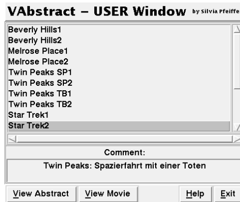
Figure 2: User Interface for VAbstract

VAbstract was implemented in about 1500 lines of ANSI C using the Vista library V2.1.3 [PKL95] [PL95]. The audio modules are currently still missing. Title extraction must be done by hand, but we are close to an automatic solution [LS96].